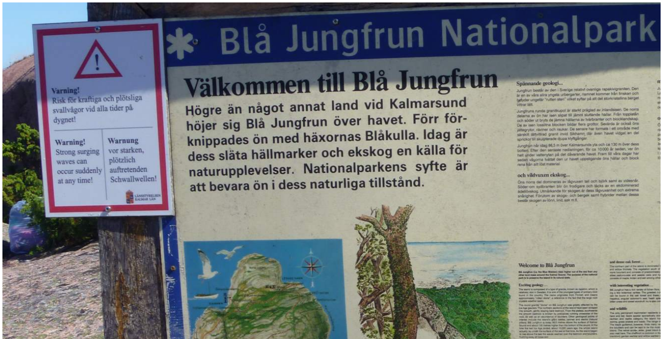
Info board, warning about possible wellles.